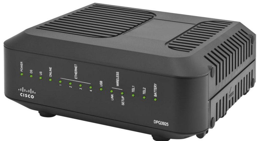
Figure 1. Cisco Model DPQ3925 8x4 DOCSIS 3.0 Wireless Residential Gateway (image may vary from actual product and specification)

The DPQ3925 is designed to meet PacketCable™ 1.5 and DOCSIS 3.0 specifications, as well as offering backward compatibility for operation in PacketCable 1.0 and DOCSIS 2.0, 1.1, and 1.0 networks.