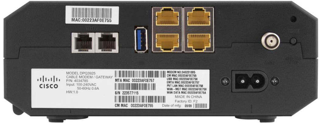
Table 2. Back Panel Features