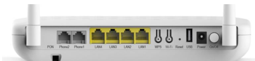
Figure 3-1 The Rear Panel of the ZXHN F660

The ZXHN F660's device interfaces as shown in Figure 3-1, include one optical interface at network side, four 10/100/1000M Ethernet interfaces, two Phone interfaces, Wi-Fi and one USB interface at user side, one Power interface