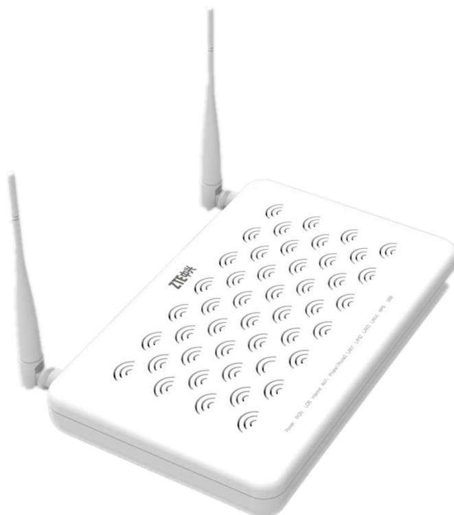
ZXHN F660 with External Antenna